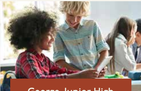
George Junior High

4700 Avenue N, Rosenberg, TX 77471 832-223-3700