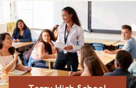
Terry High School

4601 Airport Ave, Rosenberg, TX 77471 832-223-3600