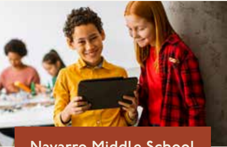
Navarro Middle School

7511 Avenue J, Beasley, TX 77417 832-223-1100