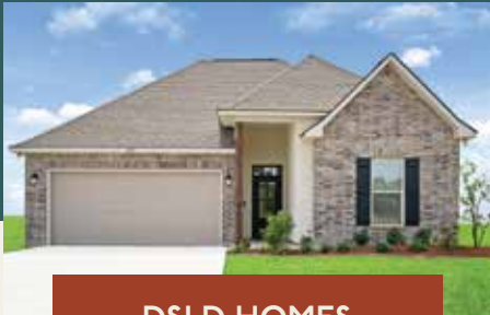
DSL D HOMES

More than 16,000 families have placed their trust in CastleRock to build safe, high-quality homes with you and your family's well-being in mind.