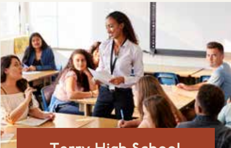
Terry High School

4601 Airport Ave, Rosenberg, TX 77471 832-223-3600