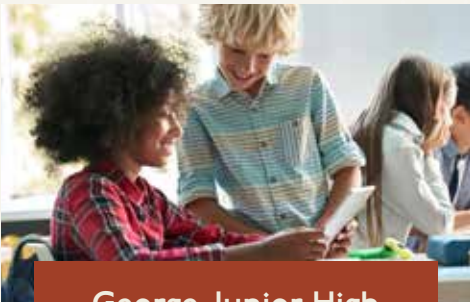
George Junior High

4700 Avenue N, Rosenberg, TX 77471 832-223-3700