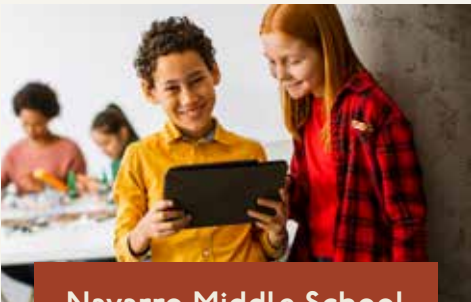
Navarro Middle School

7511 Avenue J, Beasley, TX 77417 832-223-1100