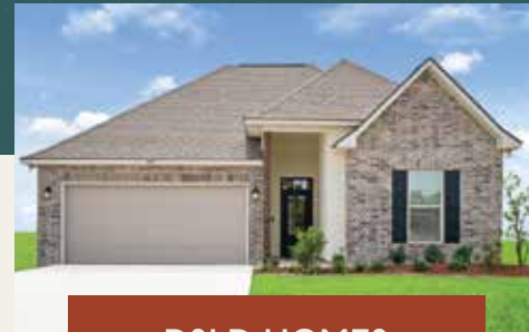
DSL D HOMES

From quality construction and materials to design personalization, Davidson Homes is committed to building beautiful, quality homes and being customer-focused.