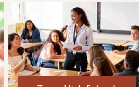
Terry High School

7500 Koeblen Rd, Richmond, TX 77469 832-223-6000