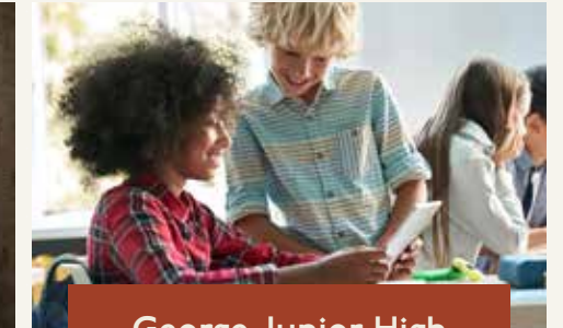
George Junior High

4700 Avenue N, Rosenberg, TX 77471 832-223-3700