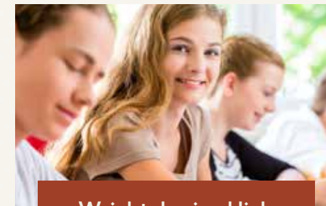
Wright Junior High

4601 Airport Ave, Rosenberg, TX 77471 832-223-3600