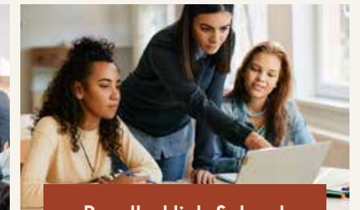
Randle High School

5500 Avenue N, Rosenberg, TX 77471 832-223-3400