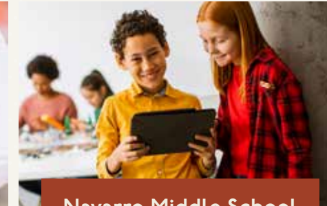
Navarro Middle School

7511 Avenue J, Beasley, TX 77417 832-223-1100